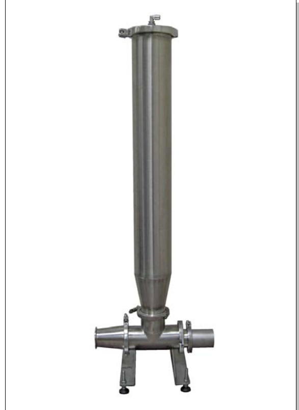
6" DIA. CHAMBER

Sanitary design approved by USDA and other agencies. Suitable for CIP operations. All components approved by USDA and FDA.