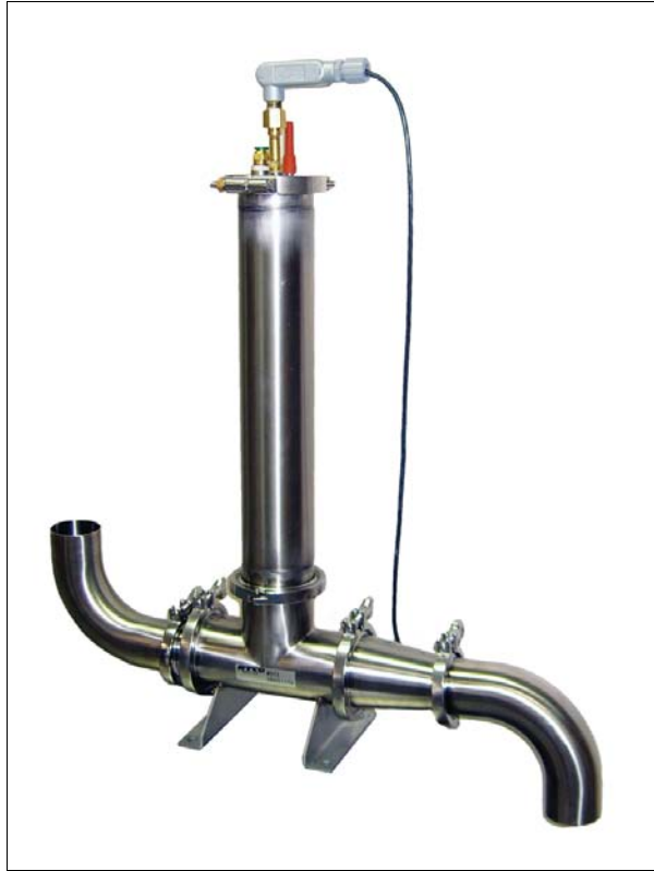
4" DIA. CHAMBER

AND OTHER FRAGILE PRODUCTS WITHOUT DAMAGE