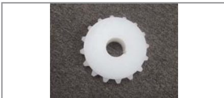
17. SPROCKET, FLATWIRE BELT