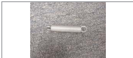
13. SPRING, LOOP BOTH ENDS