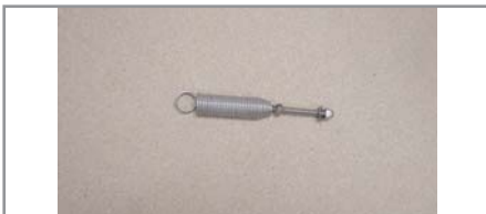
14. SPRING, LOOP/BOLT ENDS