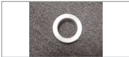
7. SET COLLAR, PLAIN