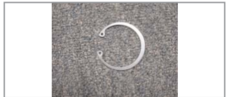
12. SNAP RING, INTERNAL