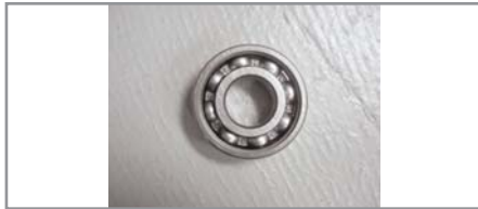
4. BALL BEARING