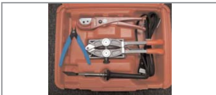
14. SPLICER KIT, POLYCORD