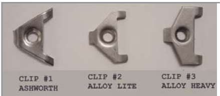
17. FLATWIRE BELT CLIPS