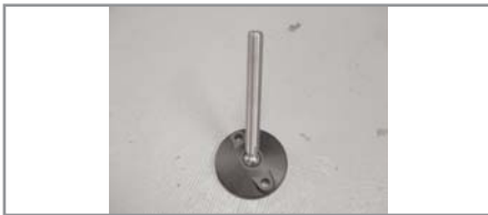
10. FOOT, ADJUSTABLE