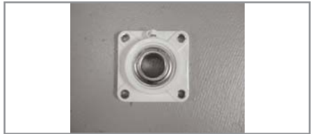
3. BEARING, 4 BOLT FLANGE