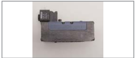
9. AIR/ELECTRIC VALVE, LARGE