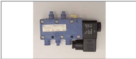
8. AIR/ELECTRIC VALVE, MEDIUM