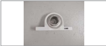
5. BEARING, PILLOWBLOCK