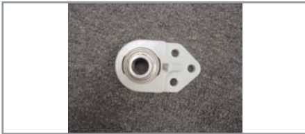
2. BEARING, 3 BOLT FLANGE