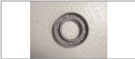
5. BEARING SEAL