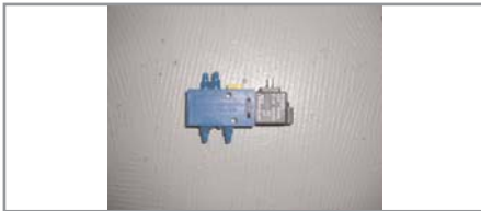
7. AIR/ELECTRIC VALVE, SMALL