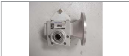
16. GEAR REDUCER, HELICAL