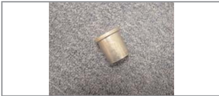
2. PLAIN BEARING, BRONZE