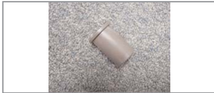
1. PLAIN BEARING, PLASTIC