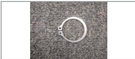
11. SNAP RING, EXTERNAL