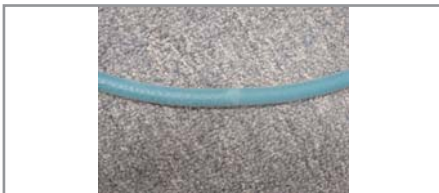
13. BELT, POLYCORD