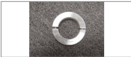
8. SETCOLLAR, 2 PIECE