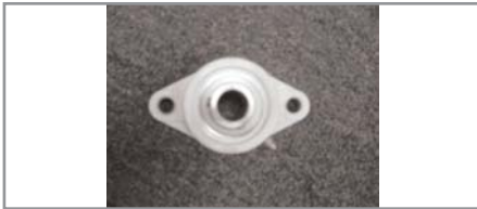
1. BEARING, 2 BOLT FLANGE