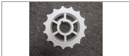
16. SPROCKET, PLASTIC BELT