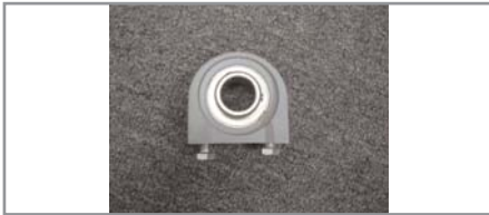
4. BEARING, TAPPED BASE